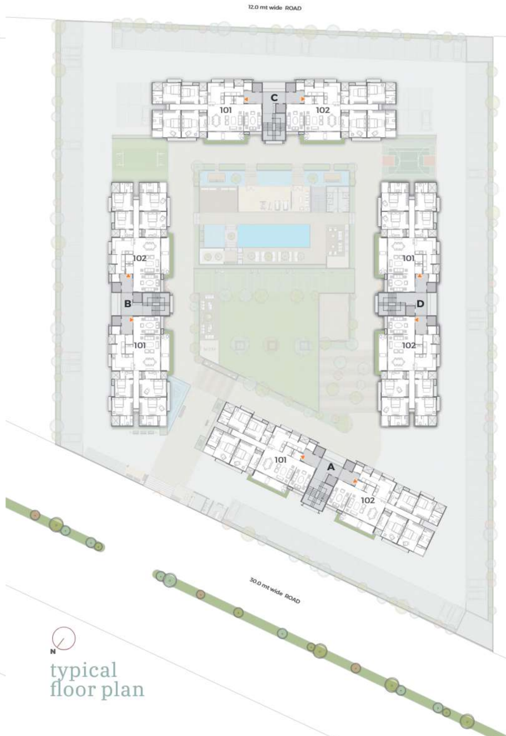
typical floor plan